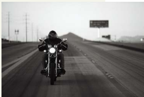
There's a new kid in town