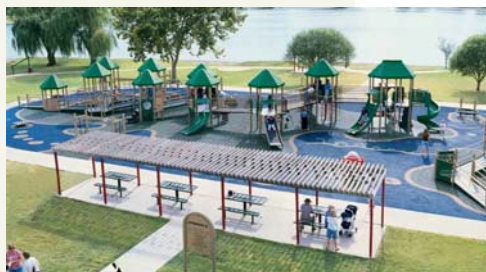
26th Street and Nashville Avenue Lubbock, Texas