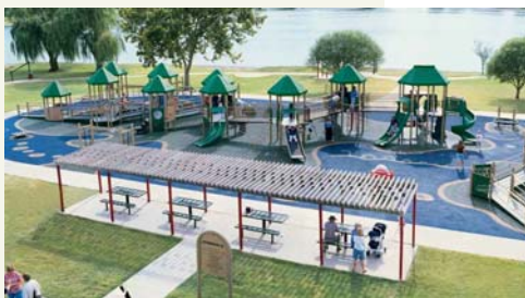
26th Street and Nashville Avenue Lubbock, Texas