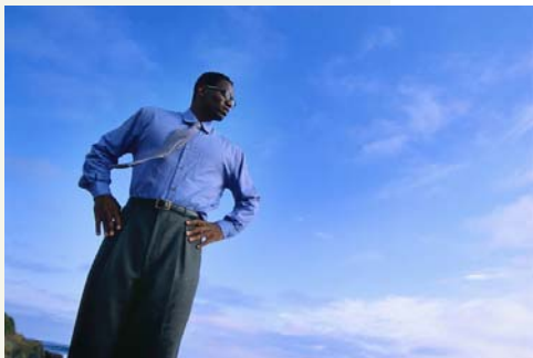
One person can make a difference.