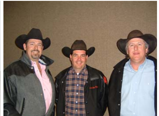
Folks from Downton were here about the upcoming ABC Pro Rodeo. For more details: