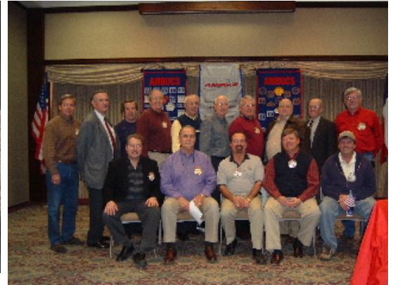
Lubbock Monterey AMBUCS Past Presidents