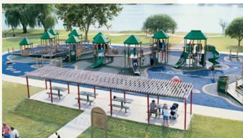
26th Street and Nashville Avenue Lubbock, Texas