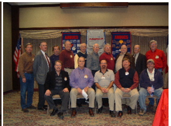
Lubbock Monterey AMBUCS Past Presidents