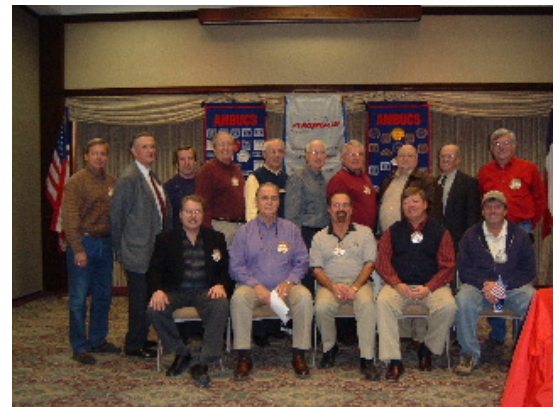
Lubbock Monterey AMBUCS Past Presidents