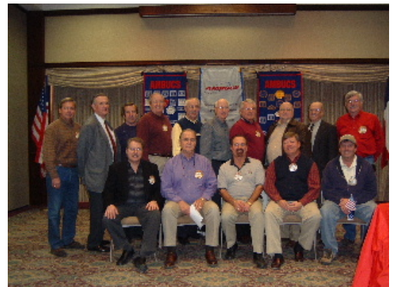
Lubbock Monterey AMBUCS Past Presidents