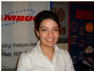
Sign up for 2006 Make-A-Wish Foundation Lubbock Home Giveaway. $50 per raffle ticket.